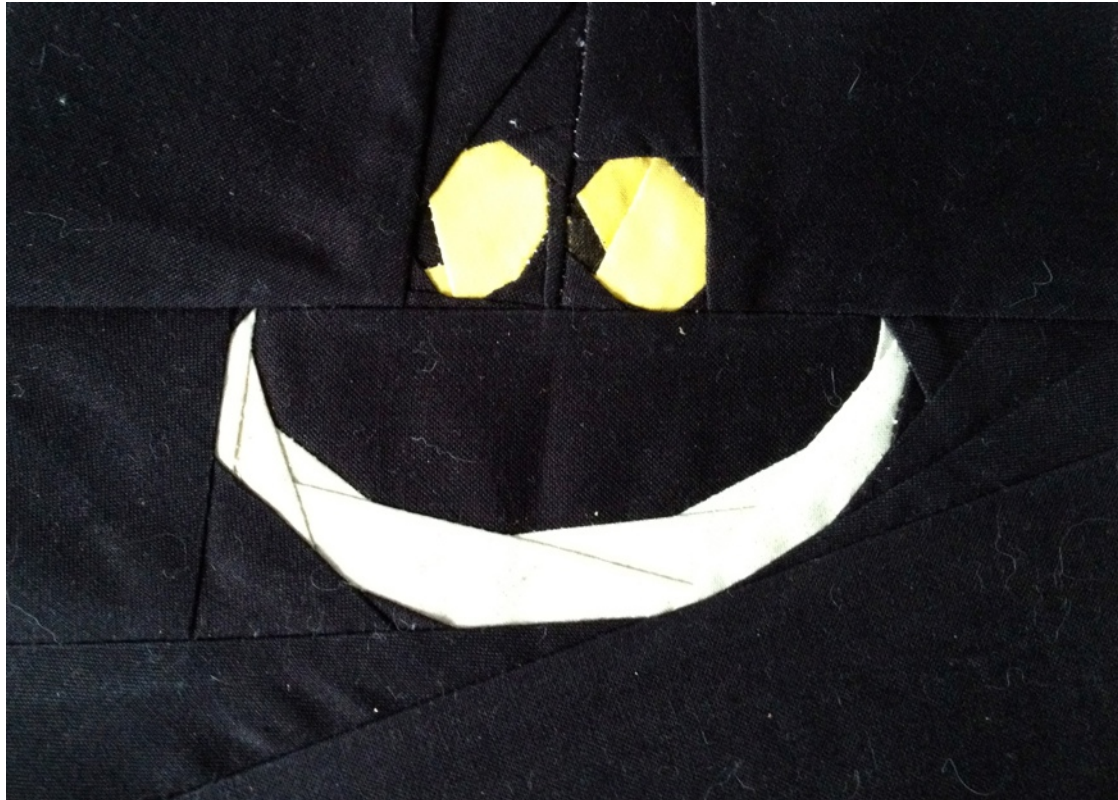
finished block 7" x 5"